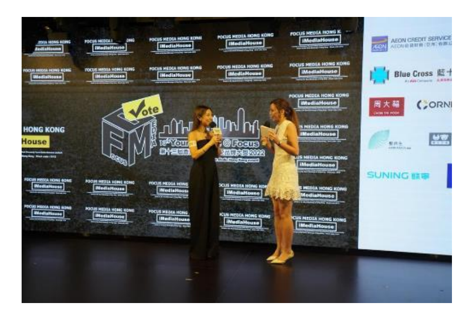
Award Presentation Ceremony at Meta Stages